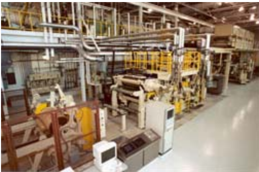
View looking from the winder/reel of the machine line upstream.