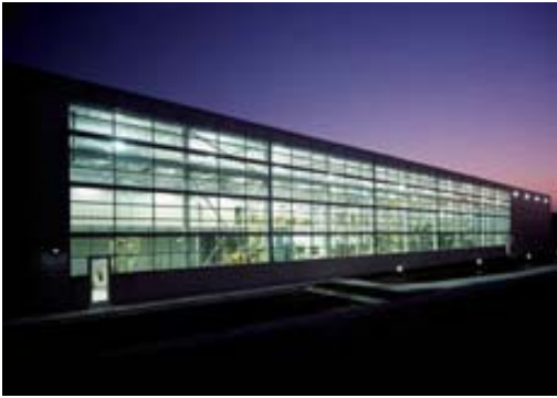
Photo of new coating pilot plant building coated on the new WMU Parkview campus – 4651 Campus Drive