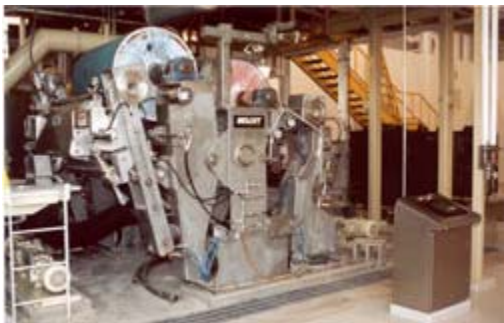
Coater applies a paint like coating to one or both sides of a paper or paperboard web. A steel blade or smooth or grooved rods meter off excess coating applied by a roll or pressure spray onto the paper surface. Also is a film press and standard pond size press.