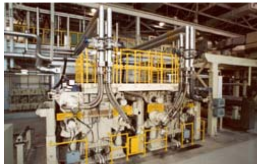
Küsters hot soft-nip calender, 4-nips—puts gloss on paper and smoothes surface for printing. Only four nip calender pilot coater in the world.