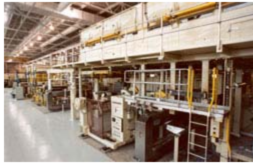
View looking downstream from the unwind to the reel. In foreground scanner (basis weight, moisture and caliper) and on top the air flotation dryers (two zones) are shown. The coater is placed just off the right edge of the photo.